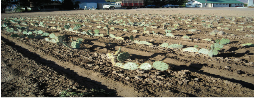
Fruita Cactus Plot 2010