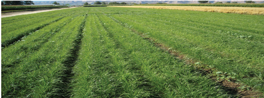
Fruita Grass Plots 2010

The Western Colorado Carbon Neutral Bioenergy Consortium (WCCNBC) was formed in 2009 to investigate the future of bioenergy and carbon sequestration in Western Colorado. The consortium is a partnership between Colorado State University, Colorado Mountain College, The City of Rifle, Garfield County and Flux Farm Foundation. This interdisciplinary, applied-science, research consortium seeks to collect both quantitative and qualitative data on the costs and benefits of land transition, agronomic analysis of high biomass producing perennial crops, field analysis of carbon sequestration potential, laboratory and pilot-scale analysis of the conversion of biomass to biofuels such as ethanol, butanol, and synthesis gas, and economic analysis of the feasibility of Western Colorado growers to produce and market carbon neutral biofuels. For more information go to www.wccnbc.org .